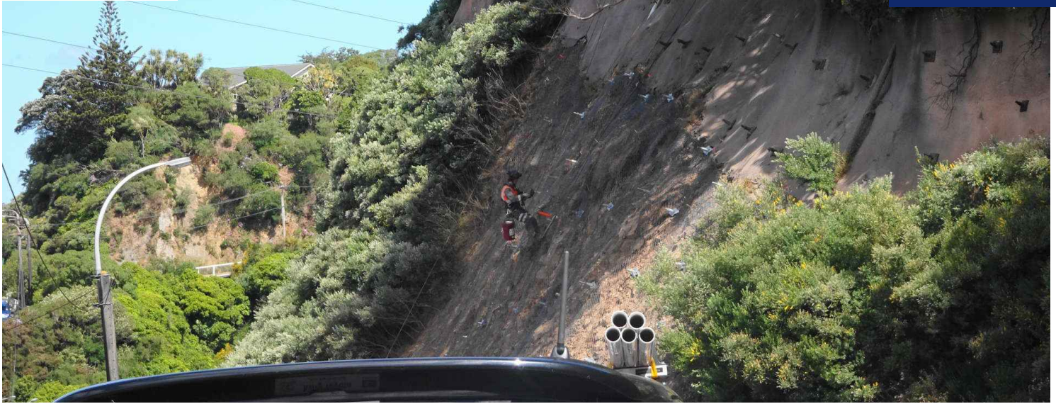
BIRDWOOD STREET KARORI SLOPE STABILISATION