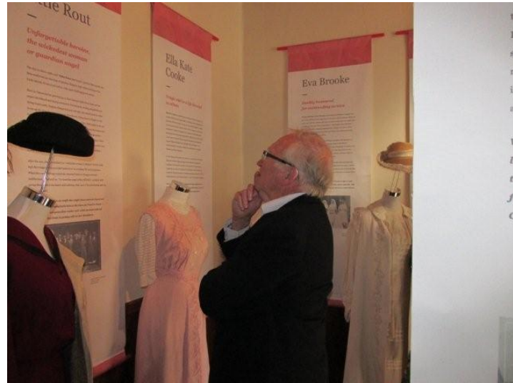
Rory contemplates the story of Ettie Rout, the “wickedest woman in Britain”