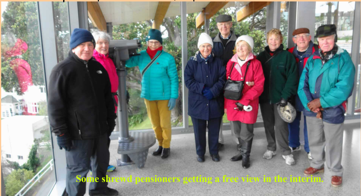
Some shrewd pensioners getting a free view in the interim.

The payscope in the upper cable car station suffered a malfunction. The mechanism needed to be taken apart and the opportunity has been taken to purchase a different coin mechanism from the manufacturer so that like the previous payscope at the lookout it will require a $2 coin instead of a $1 coin. It will be installed next week.